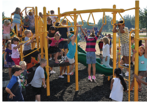
A new playground for Purdy School

Where gifts today build better tomorrows