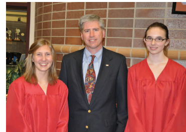
2012 Buell Merit Scholarship recipients

Among the many smaller projects facilitated by foundation funds were the restoration of the historic 1901 Water Tower, the construction of a concession stand and restrooms at the Little League fields in Memorial Park, and installation