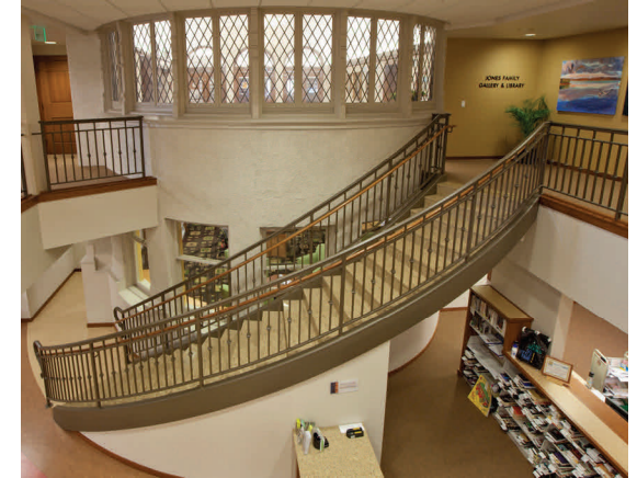
Dwight Foster Public Library Renovation

improve our community one student at a time with our extraordinary scholarship program. During the year we were pleased to fund 60 scholarships held by 53 undergraduate students, and another 20 scholarships retained by 17 graduate students — all of whom came from the Fort Atkinson area. The total amount paid in scholarships for these 70 students was a hefty $195,543.