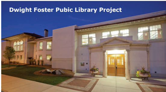
Dwight Foster Public Library Project