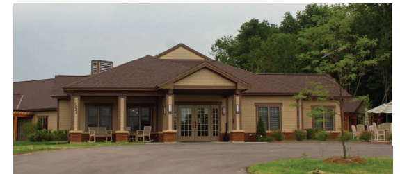
New Rainbow Hospice Inpatient Facility