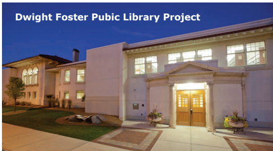
Dwight Foster Public Library Project