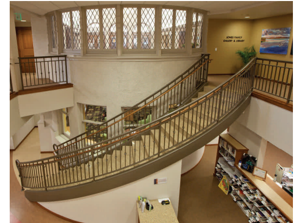
Dwight Foster Public Library Renovation

improve our community one student at a time with our extraordinary scholarship program. During the year we were pleased to fund 60 scholarships held by 53 undergraduate students, and another 20 scholarships retained by 17 graduate students — all of whom came from the Fort Atkinson area. The total amount paid in scholarships for these 70 students was a hefty $195,543.